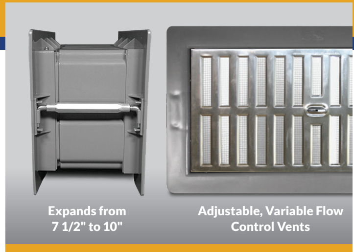
Expands from 7 1/2" to 10"

Welcome to the future of foundation ventilation – and possibly the last vent you'll ever need. Announcing Vortex™ – the first variable flow, telescopic vent.