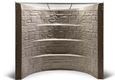
Stonewell Egress Window Well WW-44440 - Sandstone (Shown with optional cover*)