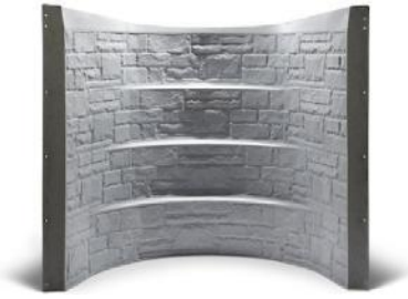
Stonewell Egress Window Well WW-44430 - Granite