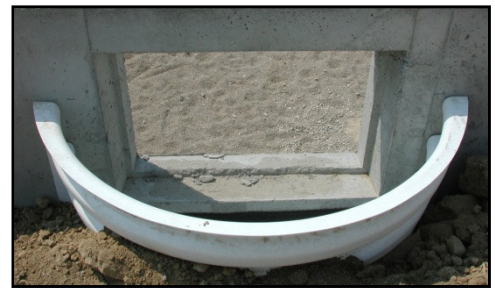
Available in Granite and Sandstone Colors