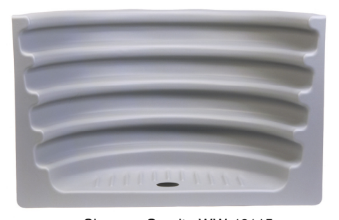
Shown – Granite WW-42115 52" width x 19" projection x 31" height