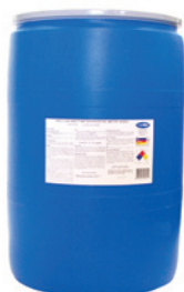
Mar-flex DampFUSION (Water-Based) RWD-01-55 55 Gallon Drum Each or 4/Pallet