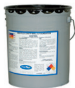
Mar-flex DampFUSION (Water-Based) RWD-01-5 5 Gallon Bucket Each or 36/Pallet

DampFUSION is an excellent acrylic dampproofing membrane. DampFUSION is a fluid applied dampproofing for the exterior of below-grade masonry, block, precast and poured concrete foundation walls. It is designed to stop water vapor and help protect against leaks.